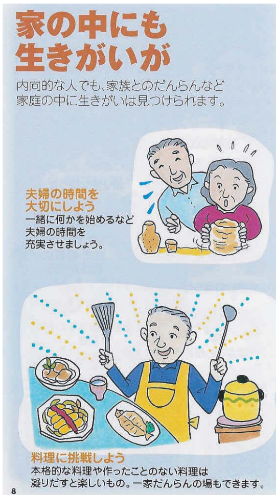
FIGURE 12.1 A page from a brochure encouraging people that they can find an ikigai even within the home.